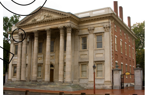
First Bank of the United States, Philadelphia, PA