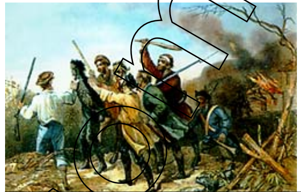
A tax collector is tarred and feathered by a group of anti-tax frontiersmen during the Whiskey Rebellion.