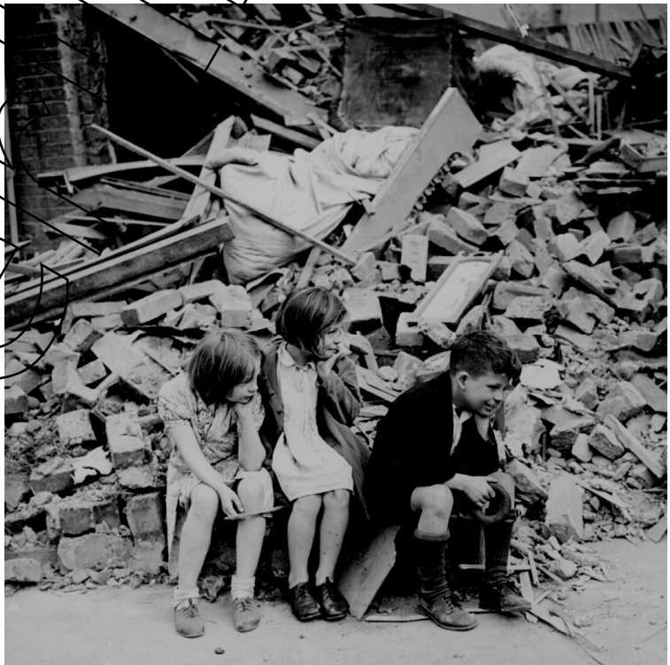
Children in a London suburb, waiting outside the wreckage of what was their home. September 1940.