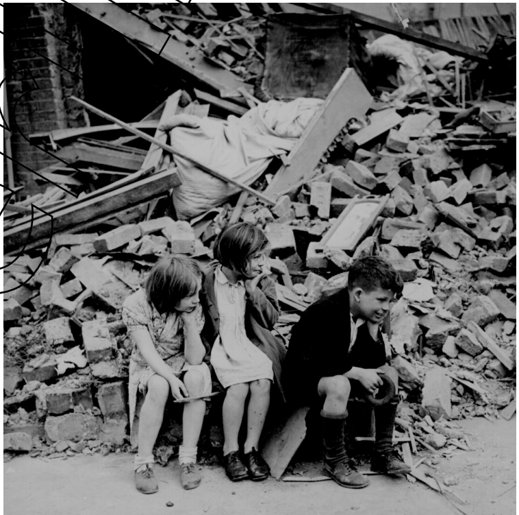
Children in a London suburb, waiting outside the wreckage of what was their home. September 1940.