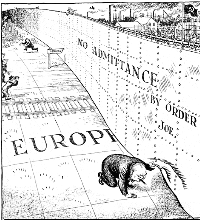
Peep under the Iron curtain March 6, 1946