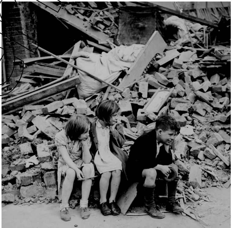
Children in a London suburb, waiting outside the wreckage of what was their home. September 1940.